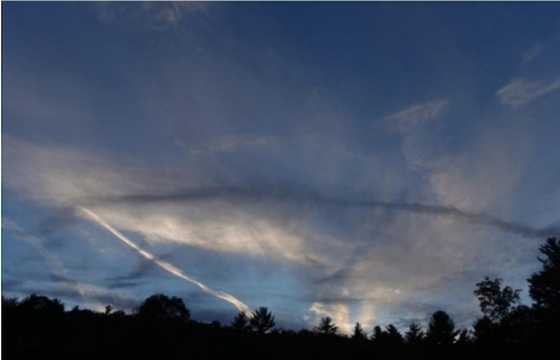
Fig.3. Chemtrails oscuros y blancos. (Herndon, J.M.; Hoisington, R.D.; Whiteside, M. 2020)